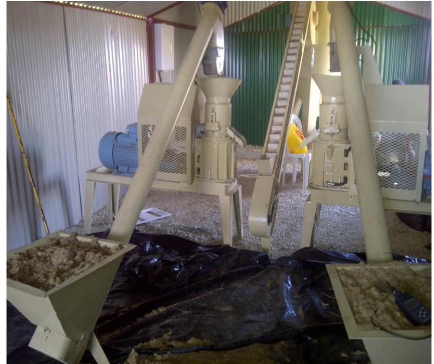
Various forms of Biomass and Waste to Energy initiatives

Biomass Production value added goods and production of fuel pellets